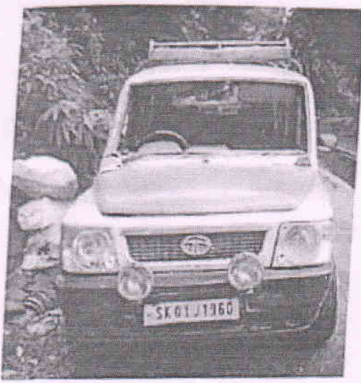
Photograph Of Accidental Vehicle Bearing Reg No. SK-01-J-1960. TATA SUMO VICTA